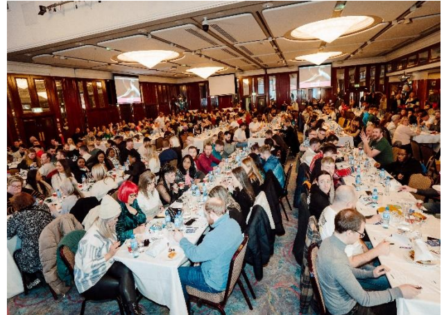
Large crowd at the GLL Communications Day