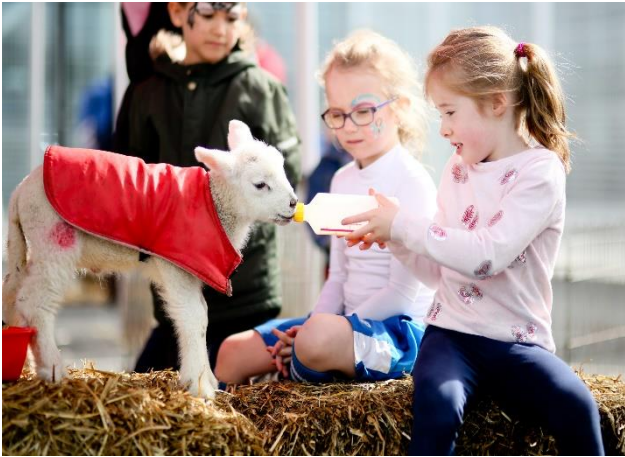
Feeding the animals at the Avoniel Family Fun Day