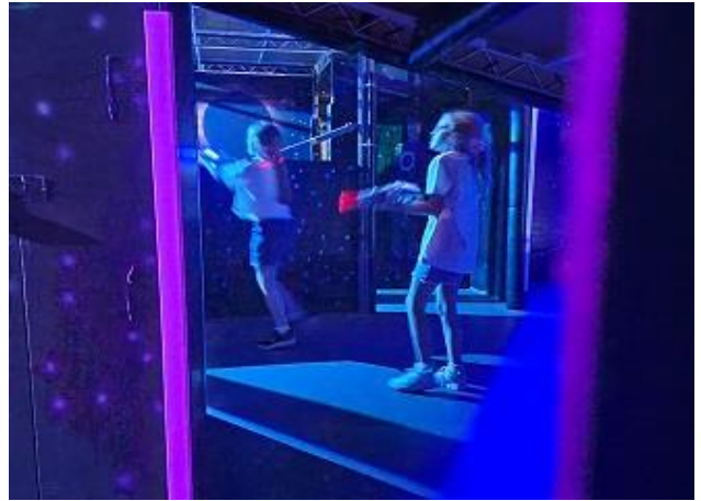
Laser Quest fun at the Indoor Tennis Centre and Ozone Complex