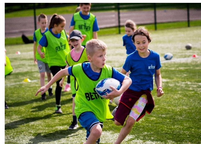
Children take part in a touch rugby session at Summer Holiday Scheme