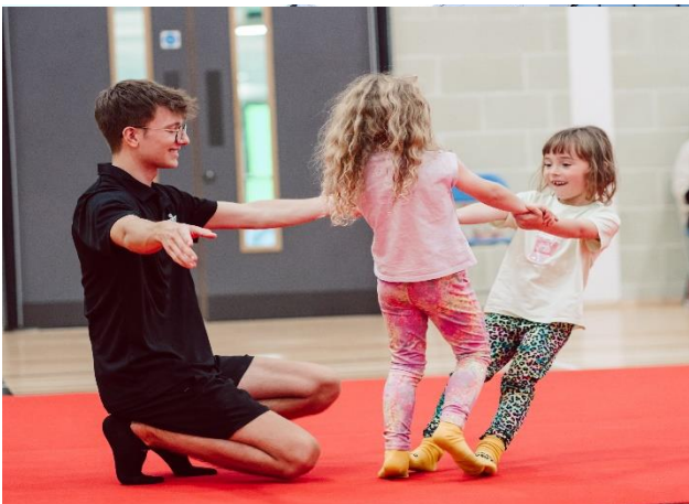
Young participants and their coach at a RISE Gymnastics session at Lisnasharragh