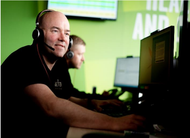
GLL Customer Service Centre located in the heart of the city and servicing the UK