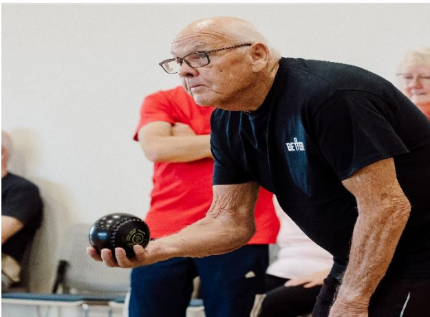
Participants play a game of indoor bowls at the Club Games at Girdwood Community