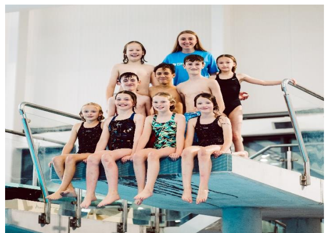
Junior participants and their coach at the Tom Daley Diving Academy in Lisnasharragh