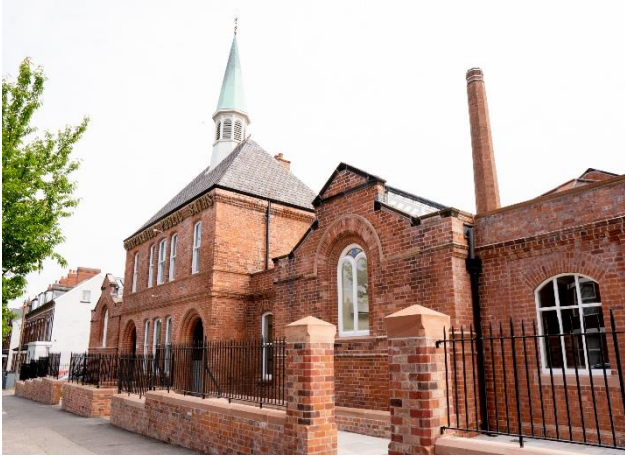
Opening day at the newly restored Templemore Baths