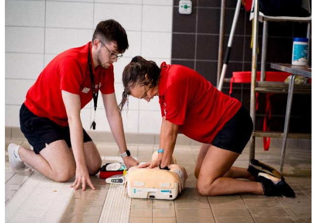
Team Lisnasharragh competing at the Top Team Lifeguard event