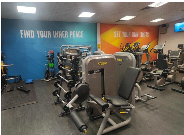
Gym refurbishments at Belvoir Activity Centre