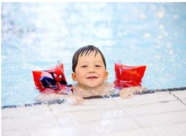
Enjoying a swim at Andersonstown Leisure Centre