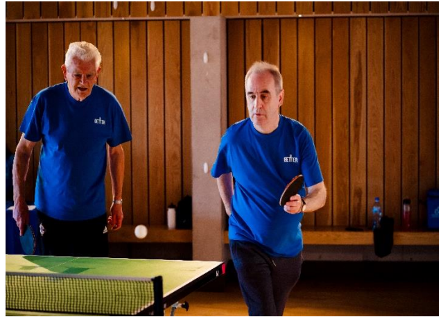
Table tennis at an Active Morning at Girdwood Community Hub