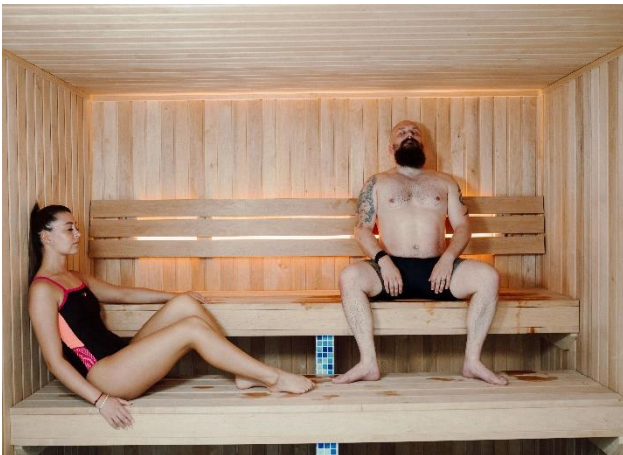
Time to relax in the health suite at Templemore Baths